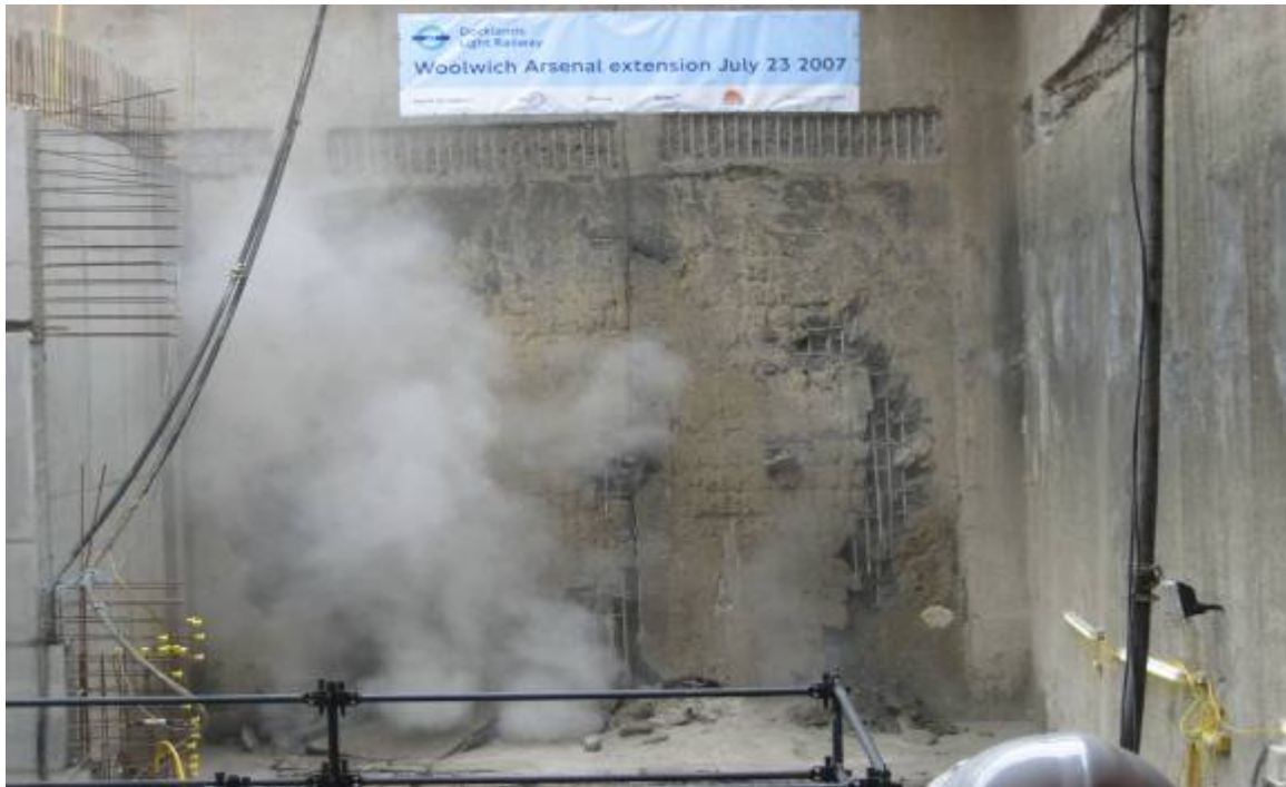
Tunnel Boring Machine Breaking Through