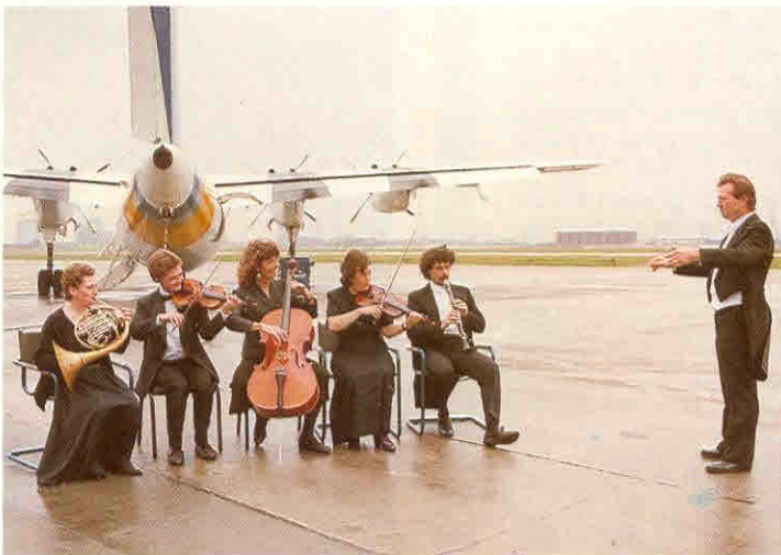
Members of the Docklands Sinfonietta rehearse on the Airport apron for their concert.

£550 for a table of eight, and include a three course dinner with wine. Call (01) 381 4337 for information and bookings.