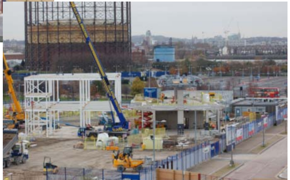
South Station - December 2011